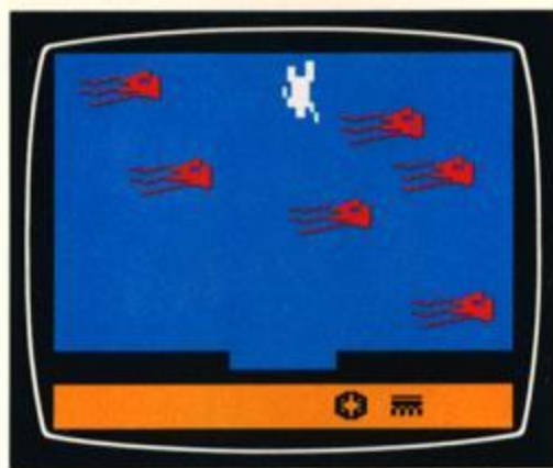
Figure 3 — School of Octopi

To enter a room with the power to manipulate all the objects in that room with your Joystick, you must guide your playing figure to the opposite side of the screen from where you start.