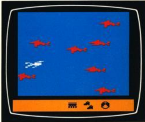
Figure 2 — Sea of Sharks

"...and I know a chariot goes in another..."