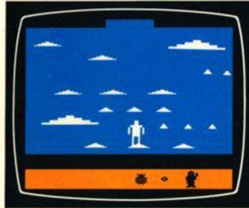
Figure 4 — Ice Floes

When you do complete a skill-and-action test successfully, an image of the Ultimate Sword of Sorcery will appear momentarily before you enter the room. If you are not successful, the word "SWORDQUEST" will appear before you are placed in the room.